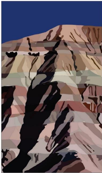
Life, Climate & Environment