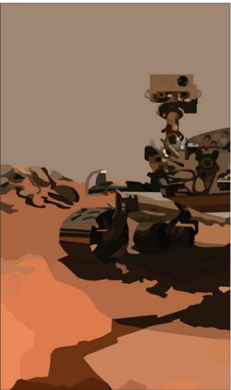
Earth & Planetary Systems

Explorer les géosciences à travers le temps et l'espace